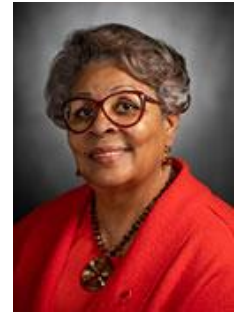
The Honorable Senfronia Thompson