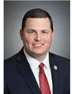
The Honorable Jared Patterson