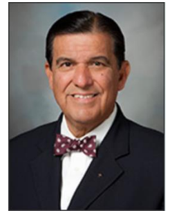
The Honorable Eddie Lucio, Jr.