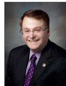
The Honorable Brian Birdwell