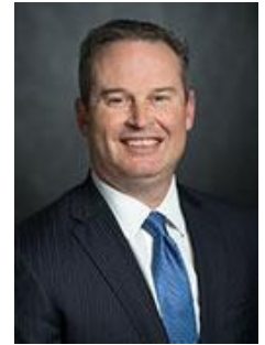
The Honorable Reggie Smith