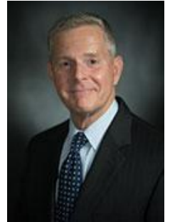
The Honorable Phil King