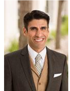
The Honorable Eddie Lucio, III